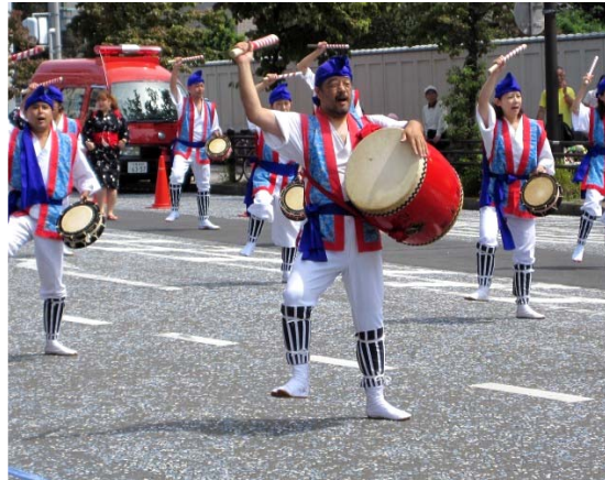
(Above) Okinawa Eisā dancers from the Festa Machida 2009.

Bon is the season in which we pray to our ancestors. People make small fires to