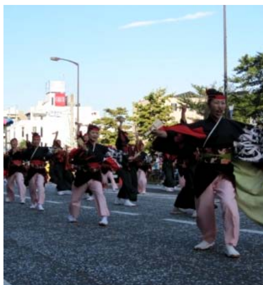
(Above) Elegant female dancers.

Why not join the party and experience the energetic Eisā at the Festa Machida in September? It will be refreshing and fill you with energy for another week in Japan.