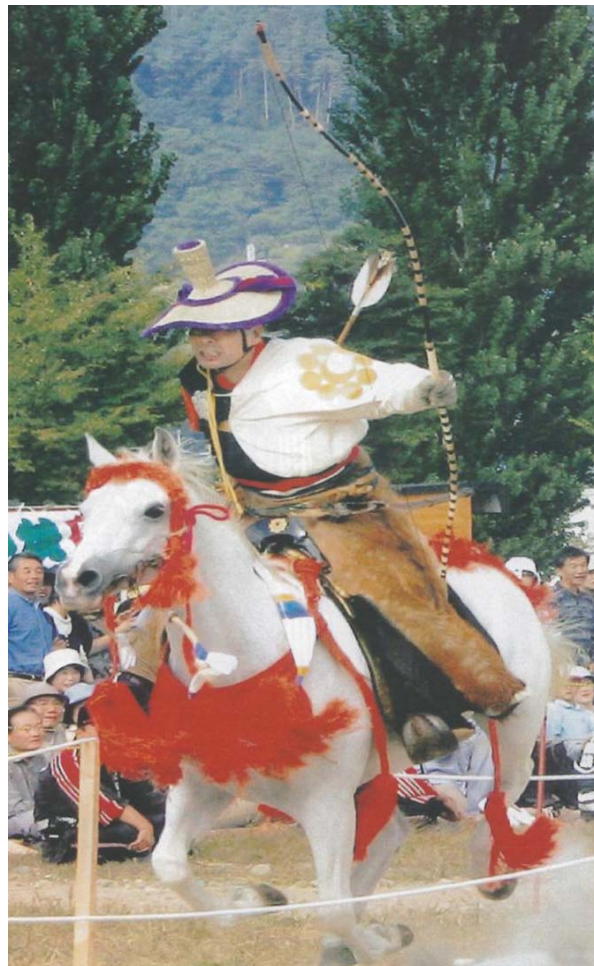
(Above) A yabusame archer leaves the audience breathless while galloping at maximum speed.

After the parade arrives at the park, various Japanese martial arts exhibitions will begin: iai , or way of sword, hōjutsu , or way of gunnery, aikidō , and more, offered by several groups. Then finally, the yabusame archers will have their turn. Not only the archers, but the entirety of the members of the festival are ready to wow the audience.