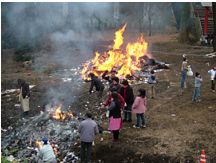
(Above) Dondo Yaki at the Sugawara Shrine. The picture image is from the official website of the Sugawara Shrine.

Japanese people see off a Toshigami , or New Year God, by burning items from New Year's Day.